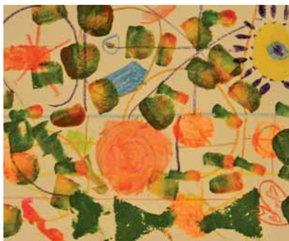
Children at The Gallery creating Beatriz Milhazes inspired artwork