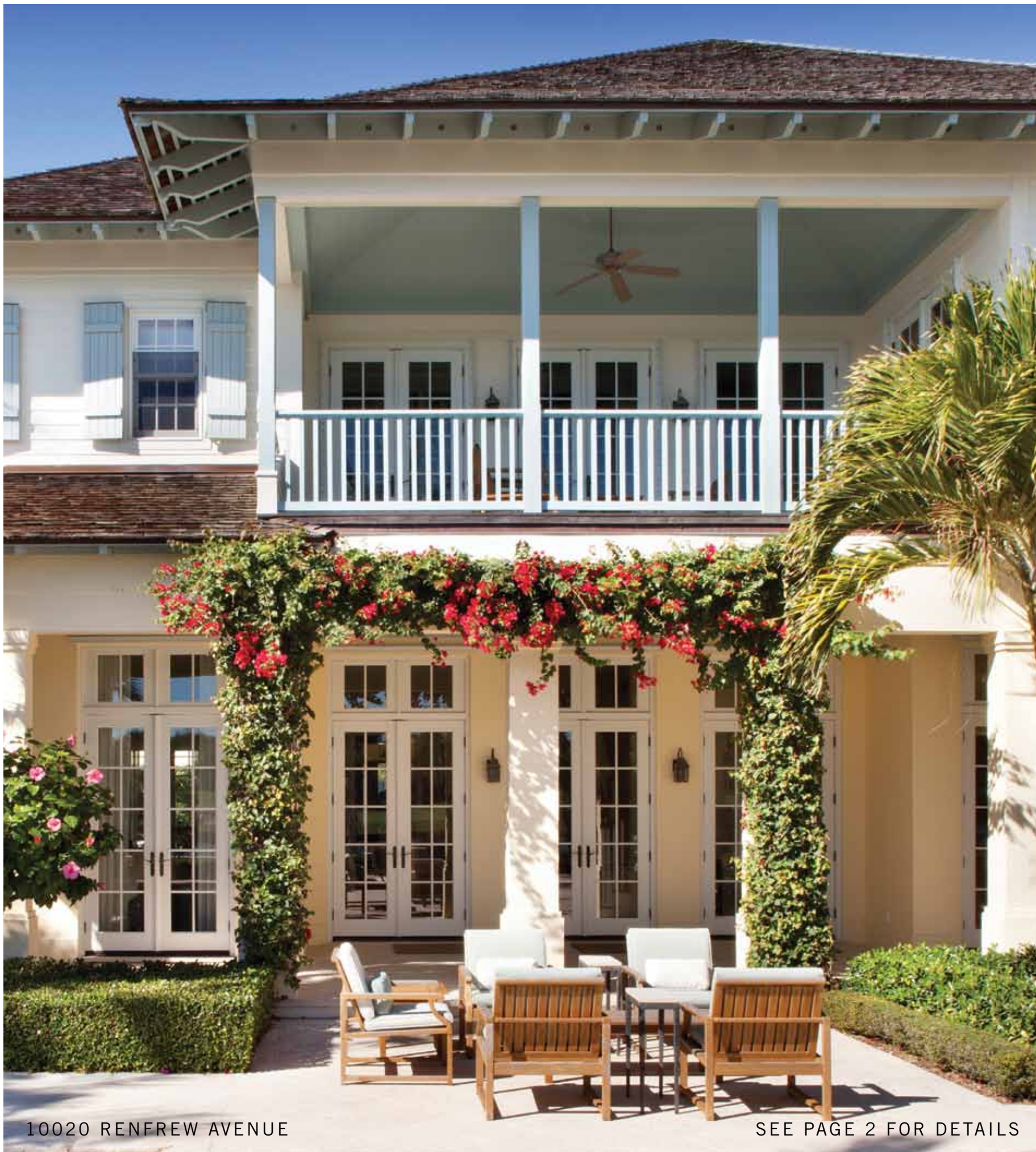
10020 RENFREW AVENUE