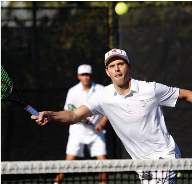
The Bryan Brothers.