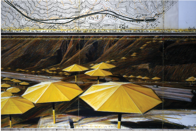
Debut of The Weston Collection of Works by Christo and Jeanne-Claude