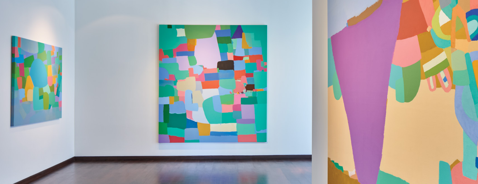
A Piece of Waterfall in the Sound of Crickets by Federico Herrero