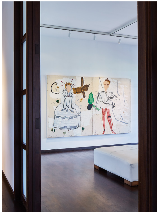
Let it Settle exhibition by British artist Rose Wylie

The first exhibition in the program by a female artist. The show included a group of paintings and drawings that reflected Wylie's interest in popular culture, deftly merging political, social, and autobiographical elements. The exhibition featured subjects as diverse as the historic British monarchy and the imaginary character Snow White, memorial crests and castles.